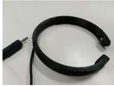
Figure 2: Throat microphone

The Kaldi toolkit [21] was used for feature extraction, training GMM-HMM, and recognition experiments. The frame length